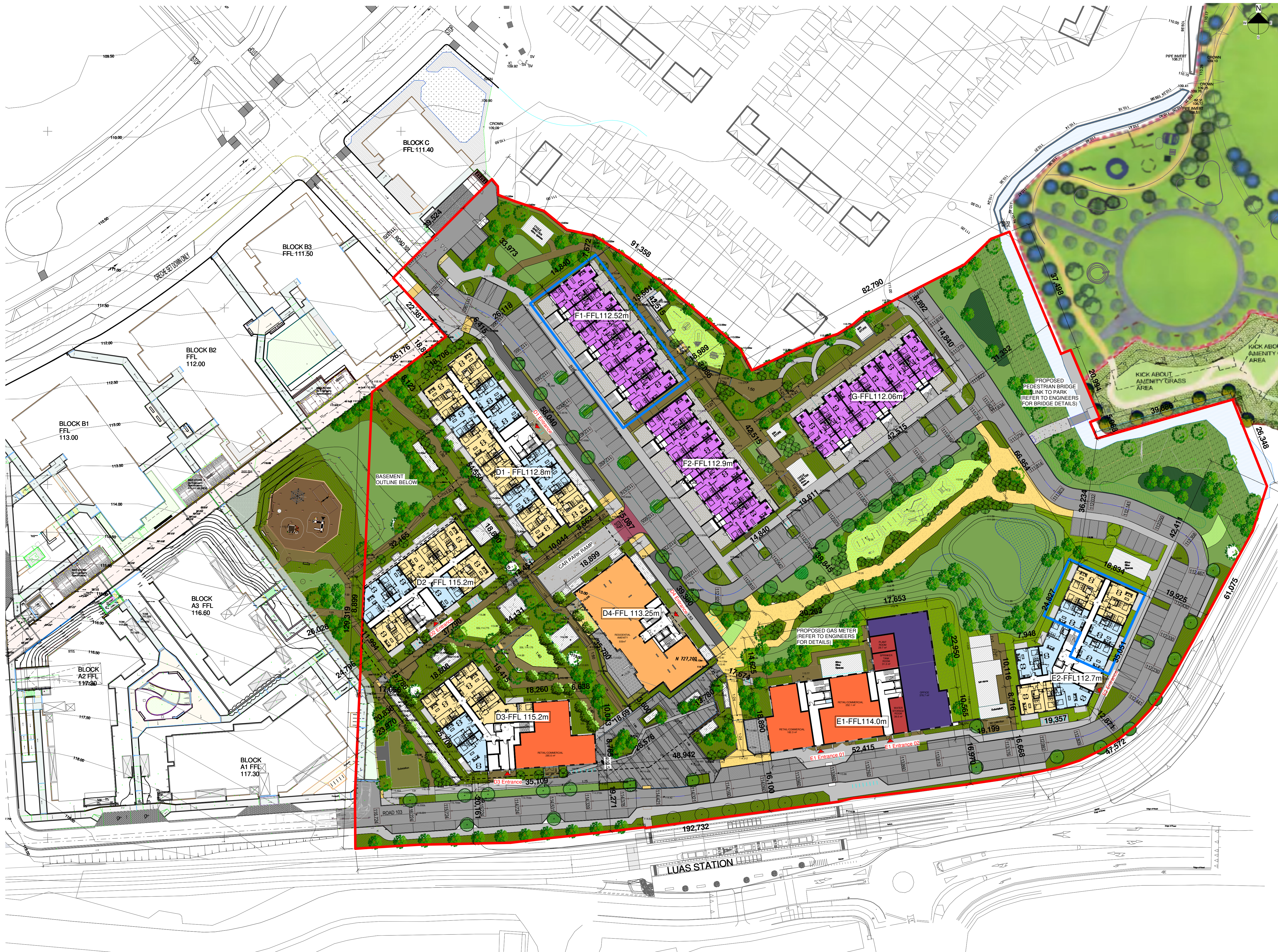
Proposed Site Layout Plan Ground Floor Level - PART V 1:500

Notes: - Do not scale from this drawing. Use figured dimensions in all cases. - Verify dimensions on site and report any discrepancies to the Architect immediately. - This drawing is to be read in conjunction with the Architect's Specification. - © This drawing is copyright and may only be reproduced with the Architect's permission.